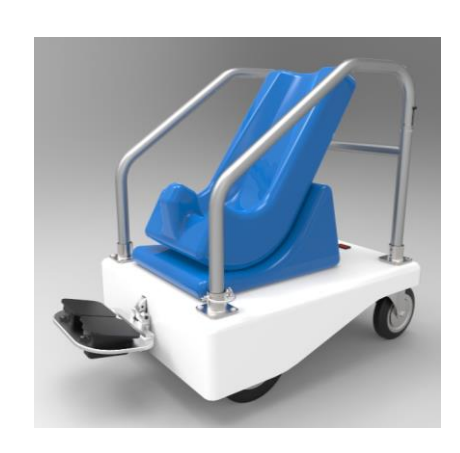
Figure 3: Keyshot® Rendering of the RAD

The CDT is ensuring a methodical approach to the design and development of a quality product by learning to apply important concepts that are practiced in industry. Additionally, exposure to team dynamics and official design reviews are facilitating the professional development of soft skills essential to engineering. Nearing the completion of MAE 490, the use of the NASA SE Handbook has proven a successful tool in the design of the RAD, and the CDT is adequately prepared to begin the Product Realization Processes during the Spring 2017 MAE 491 class. Once delivered, the RAD will facilitate an increase in the RISE student's educational and social involvement with his teachers and typical peers and will be shared by many RISE students possessing similar capabilities.